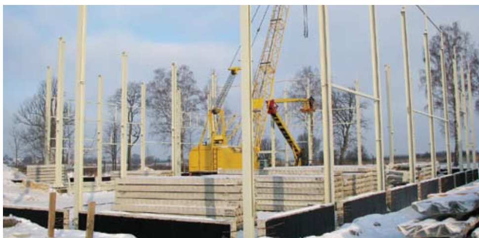
Construction works of factory manufacturing medicine in Kaliningrad (Russia)