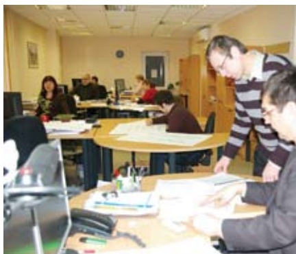
designing department (Lithuania)