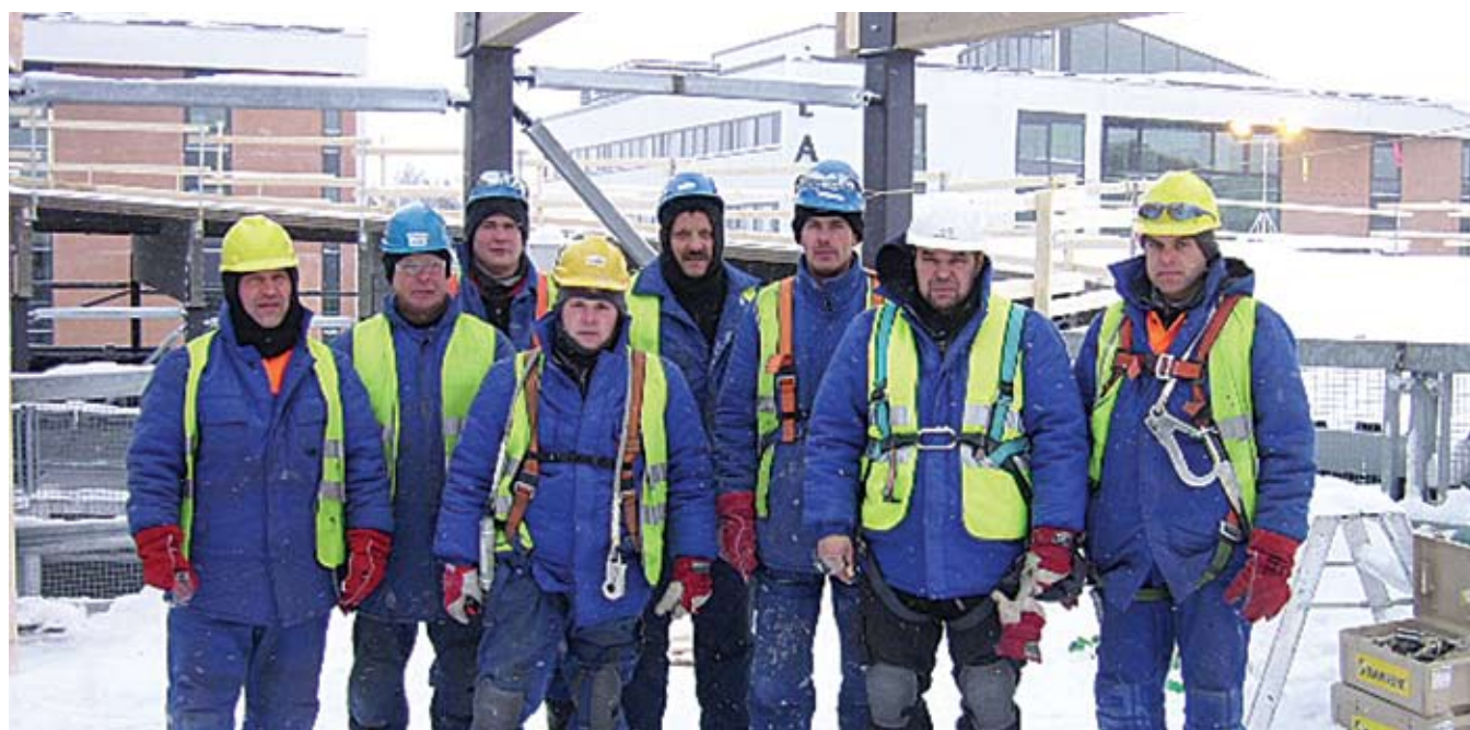
Shipbuilders in Finland

At the moment commercial department negotiates about larger objects than were last year, since the group "Litana" is already known in Finland's market.