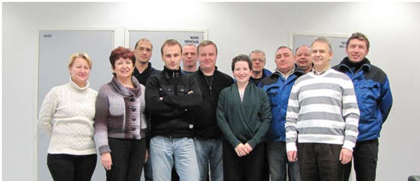
Employees of "Litana Scandinavia"

The group of companies "Litana" worked as sub-contractor in many objects in Finland: roof repair in the municipality of Turku; manufacture and assembling of metal constructions in the supermarket in Turku; assembling of outer wall panel for a hospital in Helsinki; manufacture and assembling of metal constructions also assembling of load bearing sheet in a logistics centre in Turku; manufacture and supply of metal structures for a public welfare centre in Tarvasjoen; manufacture and assembling of metal constructions for a workshop in Joensuu; manufacture and assembling of metal constructions also assembling of load bearing sheet for an energy (city) park in Ussikaupunki; works of manufacturing and installation of metal structures, installation of wooden structures and load bearing sheet for a parking place in Vanta.