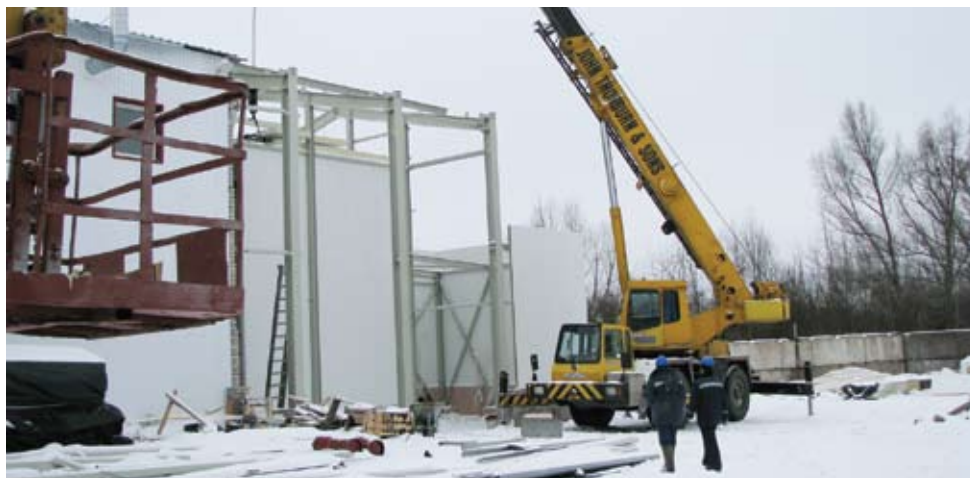
Constructions of warehouse – refrigerator in Gusev (Russia)

Constructions of a depot for repair of locomotives, 1780 m 2 will be started in Finland.