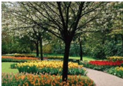
Flower garden in Kaukenhof

Amsterdam is formally the capital of the Netherlands and it's the most important city. The Port of Rotterdam is Europe's largest and most important harbor and port. The Hague is the seat of government of the Netherlands.