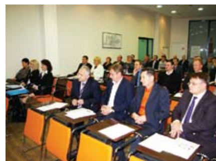
During the conference