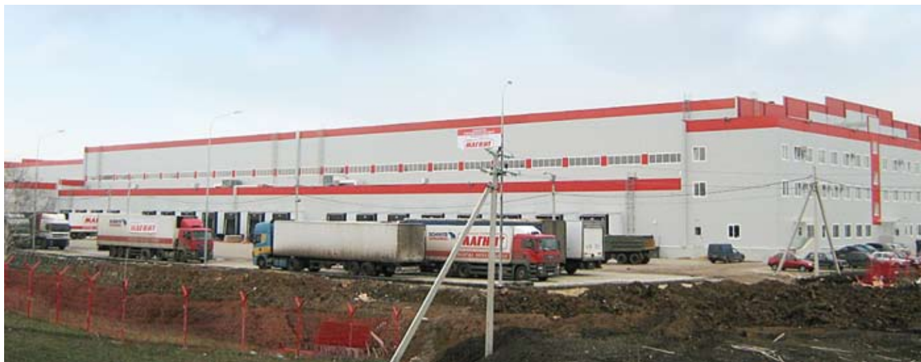
Construction of the warehouse in Tambov (Russia)

It is anticipated to complete the construction of the warehouse in Sweden.