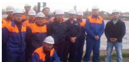
The shipbuilders of the group of companies "Litana" in Holland