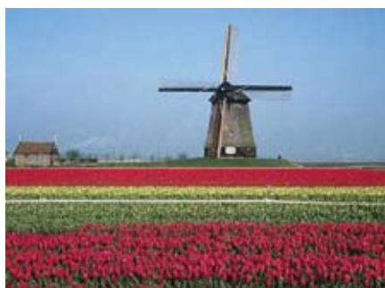
The field of tulips

The term Holland is frequently used to refer to the whole of the Netherlands.